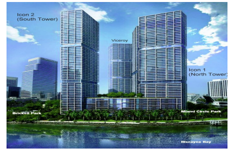
Built in 2009 - 715 units - 58 floors

Icon Condominium Association Inc 305 371 1411 & 786.220.7701 http://www.iconbrickell.com/