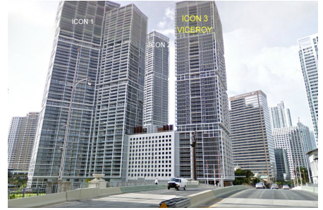
Built in 2010 - 520 units - 48 floors