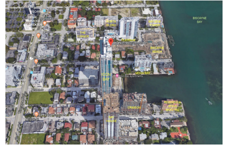
Built in 2015 - 299 units - 43 floors

Icon Bay Apartments Address: 460 NE 28th St, Miami, FL 33137 Phone: +1 305-442-0055