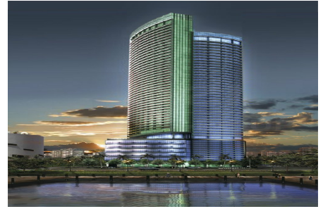
Built in 2007 - 514 units - 57 floors