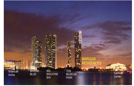
Built in 2009 - 306 units - 67 floors

Marquis Residences 1100 Biscayne Blvd, Miami, FL 33132 (305) 571-4000