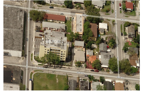
Built in 2008 - 32 units - 5 floors

Melrose Townhomes Condominium Association Inc 2575 NW 28th St, Miami, FL 33142 » Map (305) 633-0075