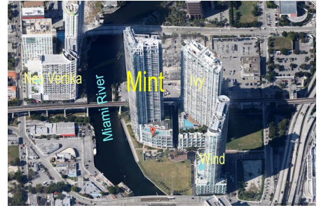
Built in 2010 - 531 units - 53 floors

Mint Condo Association 92 SW 3rd St, Miami, FL 33130 (305) 961-1620