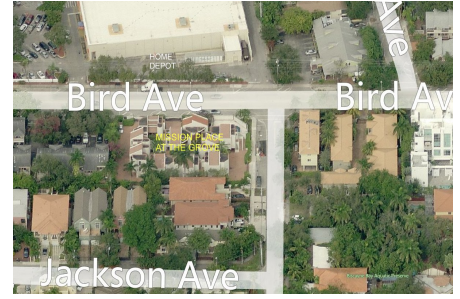
Built in 1982 - 13 units - 2 floors

MISSION PLACE AT THE GROVE CONDOMINIUM ASSOCIATION, INC.