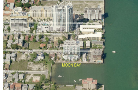
Built in 2007 - 61 units - 12 floors

Moon Bay of Miami Condo Association (305) 571-0390