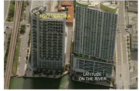
Built in 2006 - 443 units - 36 floors

Neo Vertika Condo Association (786) 623-2250 & neovertika@miamimmanagement.com http://myvertika.wordpress.com/about/