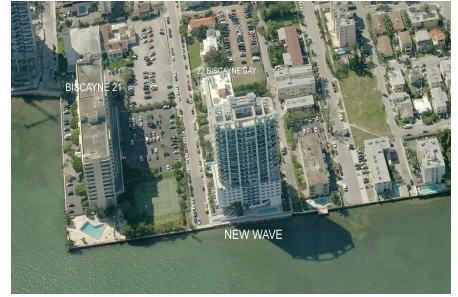
Built in 2006 - 78 units - 19 floors