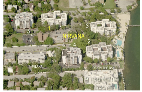
Built in 1972 - 85 units - 6 floors

Nirvana Condominium No. One Association, Inc. (Building A) 305-759-8090 http://nirvanacondos.net/modules.php?name=Content_Public&pa=showpage&pid=4