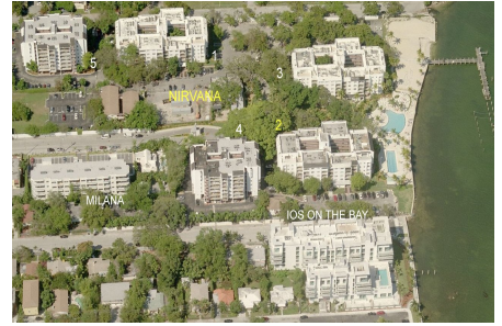
Built in 1972 - 85 units - 6 floors

http://nirvanacondos.net/modules.php?name=Content_Public&pa=showpage&pid=4