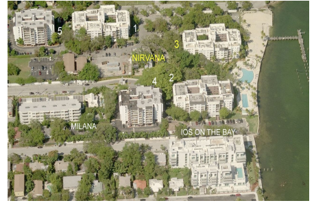
Built in 1972 - 85 units - 6 floors

http://nirvanacondos.net/modules.php?name=Content_Public&pa=showpage&pid=4