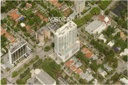
Built in 2007 - 128 units - 17 floors