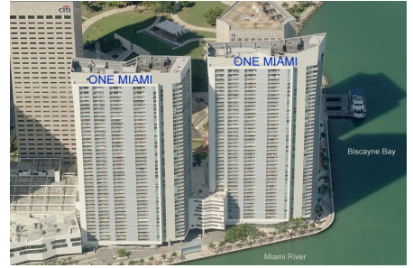
Built in 2005 - 896 units - 44 floors

One Miami Master Association (786) 425-1515