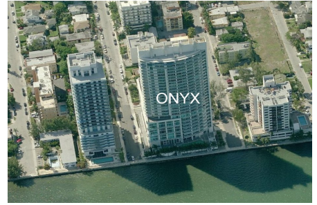
Built in 2007 - 118 units - 27 floors