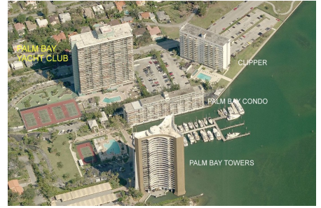
Built in 1982 - 233 units 27 floors

Palm Bay Yacht CLUB Condominium Association (305) 757-3500 PBYYCCmgr@Bellsouth.net http://pbycc.com/Management-Contacts~140741~14667.htm