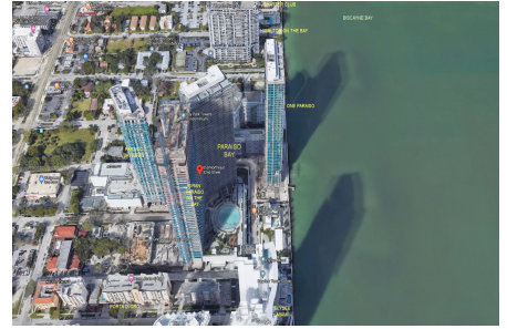
Built in 2018 - 364 units - 53 floors

Paraiso Bay Residences Address: 650 NE 32nd St, Miami, FL 33137 Phone: +1 305-390-0416 https://www.paraisobaycondomiami.com/index.htm