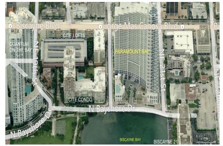
Built in 2010 - 346 units - 47 floors

Paramount Bay Condominium Association Inc 2020 N Bayshore Drive Miami, FL 33137-515 (305) 495-6906 http://paramountbay.com/