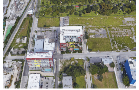
Built in 2005 - 70 units - 6 floors