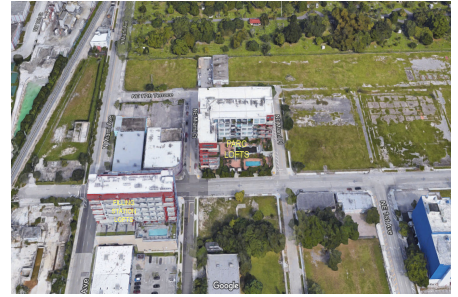
Built in 2005 - 70 units - 6 floors