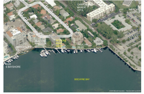
Built in 1984 - 14 units - 6 floors

Pelican Reef Condominium Associates Address 1632 S Bayshore Ct Miami, FL 33133-4030 Phone Number 305-858-2141