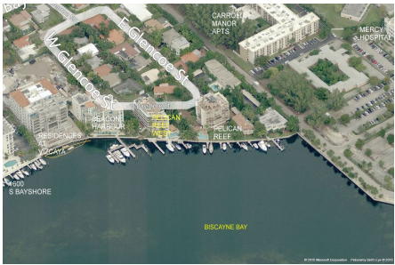
Built in 1984 - 14 units - 6 floors

Pelican Reef Condominium Associates Address 1632 S Bayshore Ct Miami, FL 33133-4030 Phone Number 305-858-2141