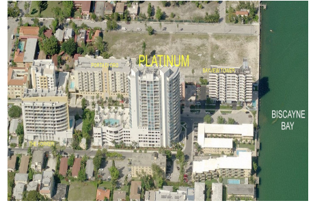
Built in 2007 - 118 units - 21 floors