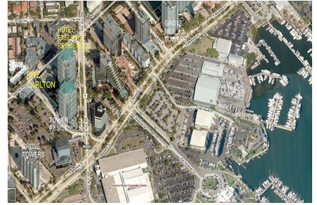
Built in 2003 - 87 units - 21 floors