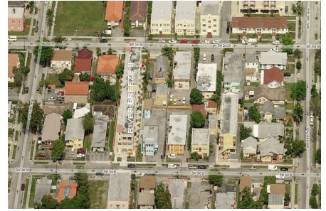
Built in 2007 - 16 units - 3 floors