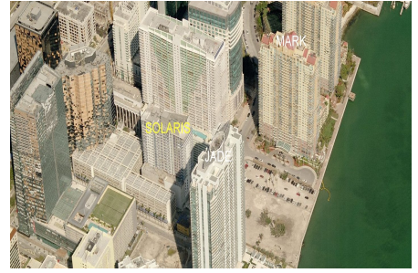
Built in 2006 - 137 units - 22 floors

Number of units: 137 Number of active listings for rent: 5 Number of active listings for sale: 1 Building inventory for sale: 0% Number of sales over the last 12 months: 1 Number of sales over the last 6 months: 0 Number of sales over the last 3 months: 0