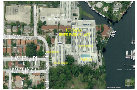
Built in 2010 - 214 units - 27 floors

Terrazas River Park Village 1861 NW S River Dr Miami, FL 33125 (305) 541-6111 (855) 233 1591 http://terrazasapts.com