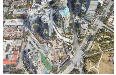
Built in 2018 - 73 units - 23 floors