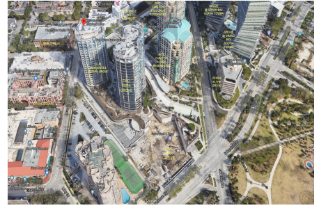
Built in 2018 - 73 units - 23 floors