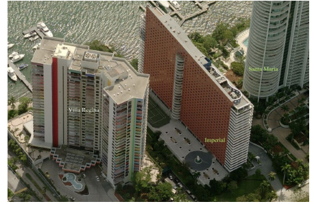
Built in 1982 - 203 units - 27 floors

Villa Regina Condominium Association (305) 858-1581