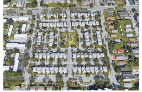
Built in 2006 - 80 units - 2 floors