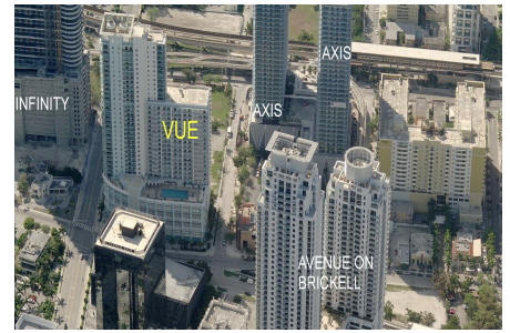
Built in 2005 - 324 units - 36 floors

Vue at Brickell Condominium inc 305.371.8005