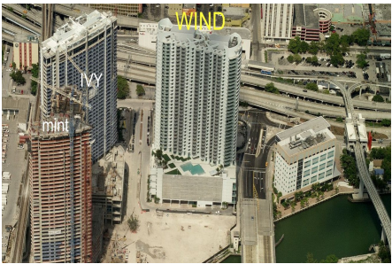
Built in 2008 - 488 units - 40 floors