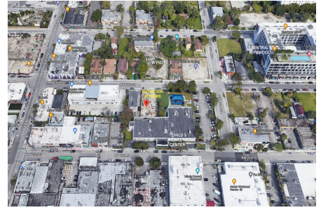
Built in 2022 - 31 units - 5 floors

Number of units: 31 Number of active listings for rent: 0 Number of active listings for sale: 0 Building inventory for sale: Number of sales over the last 12 months: 0% Number of sales over the last 6 months: 0 Number of sales over the last 3 months: 0