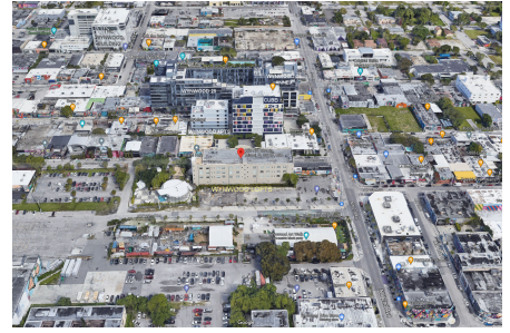
Built in 2005 - 35 units - 4 floors

Wynwood Lofts Address: 250 NW 23rd St, Miami, FL 33127