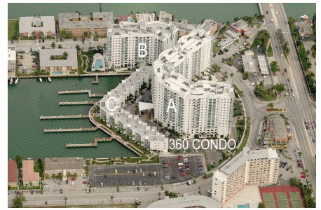
Built in 2007 - 99 units (414 with buildings A & C)- 12 floors

360 Condominium Association (786) 378-5860