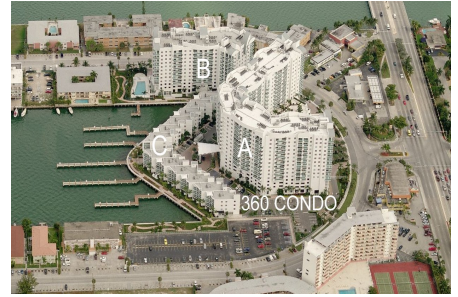
Built in 2007 - 36 units (414 with buildings A & B) - 3 floors

360 Condominium Association (786) 378-5860