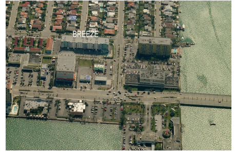
Built in 2006 - 66 units - 5 floors

Number of units: 66 Number of active listings for rent: 0 Number of active listings for sale: 0 Building inventory for sale: Number of sales over the last 12 months: 0% Number of sales over the last 6 months: 0 Number of sales over the last 3 months: 0