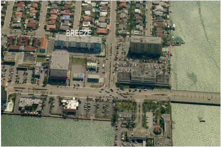
Built in 2006 - 66 units - 5 floors