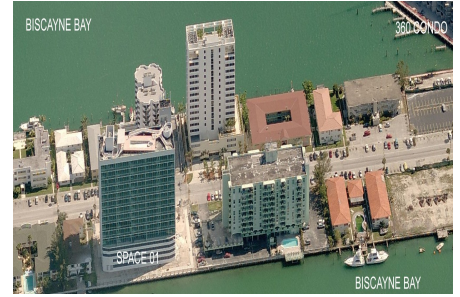
Built in 2006 - 54 units - 15 floors

Space01 Condominium Association (305) 754-7738 & (305) 754-9793