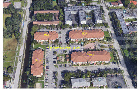
Built in 2007 - 96 units - 3 floors

Number of units: 96 Number of active listings for rent: 4 Number of active listings for sale: 0 Building inventory for sale: Number of sales over the last 12 months: 0% Number of sales over the last 6 months: 0 Number of sales over the last 3 months: 0 The Oaks in North Miami Address: 13820 NE 3rd Ct, North Miami, FL 33161, USA Phone: +1 786-217-6841