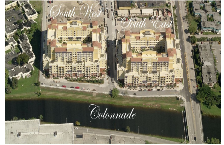
Built in 2007 - 148 units - 10 floors

Colonnade At Dadeland SE Condo (305) 663-5454