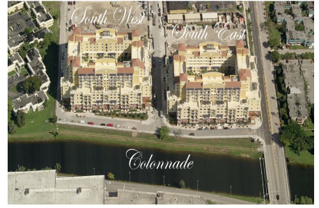
Built in 2008 - 150 units - 10 floors

Colonnade at Dadeland Condo Association Management Office 8390 Southwest 72nd Avenue Miami, FL 33143 (305) 663-5454