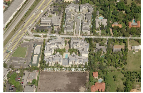
Built in 2003 - 68 units - 4 floors

Number of units: 68 Number of active listings for rent: 0 Number of active listings for sale: 1 Building inventory for sale: 1% Number of sales over the last 12 months: 4 Number of sales over the last 6 months: 2 Number of sales over the last 3 months: 1