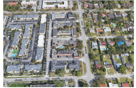
Built in 1964 - 90 units - 2 floors

LUDLAM GARDENS CONDOMINIUM ASSOCIATION, INC. 6780 SW 44th St Miami, FL 33155 (786) 402-2517