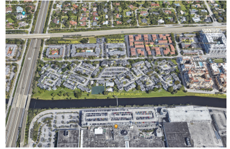
Built in 1968 - 408 units - 4 floors

Village at Dadeland Condominium Association Address: 7440 SW 82nd St, Miami, FL 33143 Phone: +1 305-667-2991