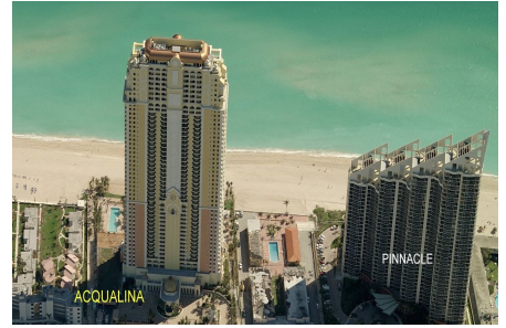
Built in 2005 - 247 units - 51 floors

Acqualina 305-918-8000 http://www.acqualina.com