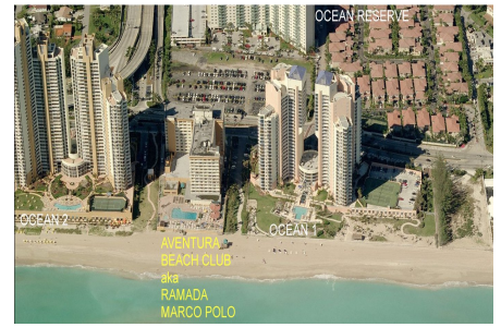
Built in 1966 - 509 units - 11 floors

Ramada Plaza - Aventura Beach Club Condominium Association, Inc 305-932-2233