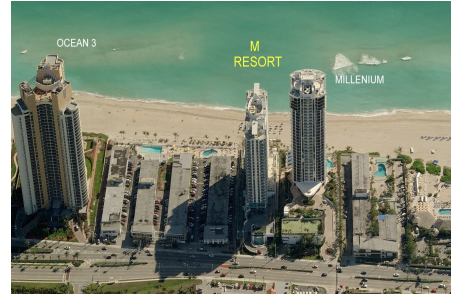
Built in 2005 - 210 units - 25 floors

Number of units: 210 Number of active listings for rent: 0 Number of active listings for sale: 7 Building inventory for sale: 3% Number of sales over the last 12 months: 9 Number of sales over the last 6 months: 5 Number of sales over the last 3 months: 1