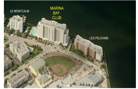
Built in 2002 - 100 units - 13 floors

Marina Bay Club Condominium (305) 466-2773