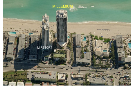
Built in 1999 - 117 units - 33 floors

Millennium Condominium Association inc (305) 937-2142 & millenniummgr@bellsouth.net http://www.millenniumcondo.net/contacts.html