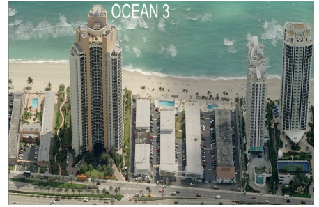
Built in 2003 - 215 units - 35 floors

Number of units: 215 Number of active listings for rent: 1 Number of active listings for sale: 5 Building inventory for sale: 2% Number of sales over the last 12 months: 2 Number of sales over the last 6 months: 0 Number of sales over the last 3 months: 0